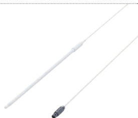
PT 100.300 PTFE-coated temperature sensor. Length: 300 mm Suitable for reactor vessels with volumes of 500 ml and 1000 ml. Ident No.: 0020114304