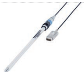
SY pH 425 pH electrode Length: 425 mm Suitable for reactor vessels with volumes of 2000 ml and 5000 ml. Ident No.: 0020114415