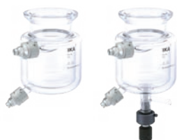
1000 milliliter volume