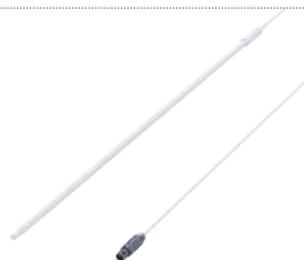
PT 100.500 PTFE-coated temperature sensor. Length: 500 mm Suitable for reactor vessels with volumes of 2000 ml and 5000 ml. Ident No.: 0020114305