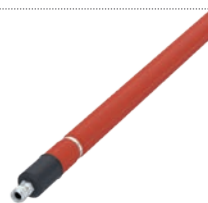
LT 5.30 | 31 | 32 Tempering hose, 2 pcs. Length: 800 | 1200 | 1600 mm Temperature range: -60 – 300 °C Pressure resistance: 3 bar Ident No.: 0020108012 Ident No.: 0020110278 Ident No.: 0020113271