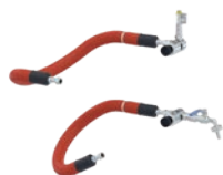
LT 5.40 Draining set By using the draining set, easy and clean draining of the temperature fluid is made possible. Ident No.: 0020113266