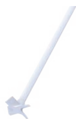
R 4011 SY Ident No.: 0020114111