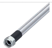
H.FKM.12 Hose set DN 12, 2 pcs. Length: 1500 mm Temperature range: -30 – 180 °C Pressure resistance: 1 bar Ident No.: 0004569300