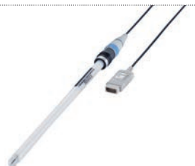
SY pH 325 pH electrode Length: 325 mm Suitable for reactor vessels with volumes of 500 ml and 1000 ml. Ident No.: 0020114414