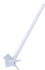
R 4012 SY Ident No.: 0020114112