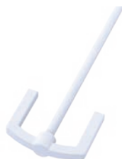
R 4021 SY Ident No.: 0020114114