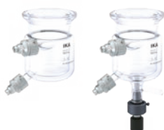
500 milliliter volume