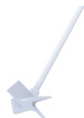
R 4013 SY Ident No.: 0020114113