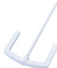
R 4022 SY Ident No.: 0020114115