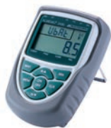
ALMEMO 2490 pH measuring device Ident No.: 0004709300

Further accessories can be found at www.ika.com