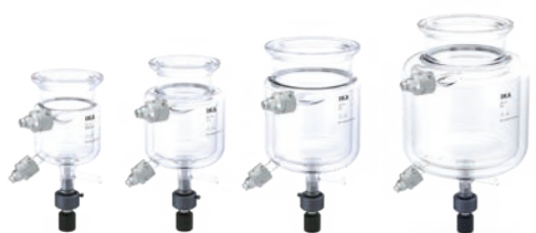
500 – 5000 milliliter volume

These reactor vessels have what it takes. They are available with 500, 1000, 2000 and 5000 milliliter volumes and with or without a bottom drain valve. The spring-loaded valve spindle prevents stresses in the glass and thus glass breakage. All vessels are made of borosilicate glass 3.3, which means they are chemically resistant.