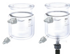
2000 milliliter volume