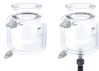
5000 milliliter volume